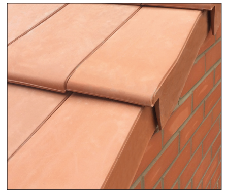
Crest Nelskamp clay right hand cloaked verge.