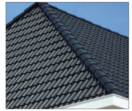
Crest Nelskamp Dry Fixing System.

*As per European trademark Nr.7287956, filed on 2nd October 2008, the Trademark PLANUM belongs to La Escandella. It is Dachziegelwerke Nelskamp as authorized licensee of the owner allowed to use the mark PLANUM for its concrete product.